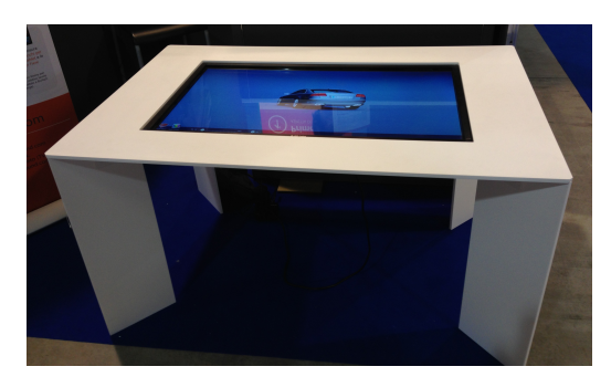
Figure 1: Our tabletop solution was designed by an expert interior architect.

market is little more than a "big iPad mounted on four legs".