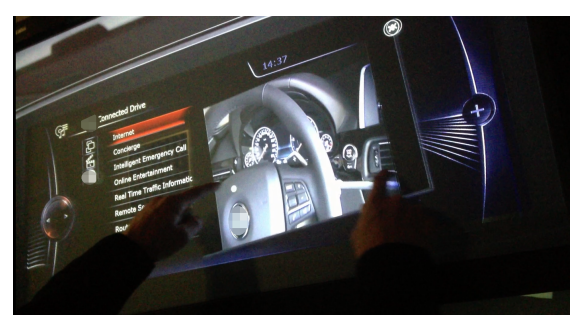
Figure 5: Screenshot from an application developed for car market.

The application was created using Tactive , therefore the developer only needs to assemble the content into web pages. The Javascript API was used to implement the communication between windows, i. e.,