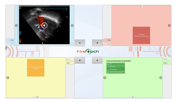
Figure 4: Screenshot from an application developed for doctors training.

Windows Manager, which is in charge of triggering the right response to the right window.