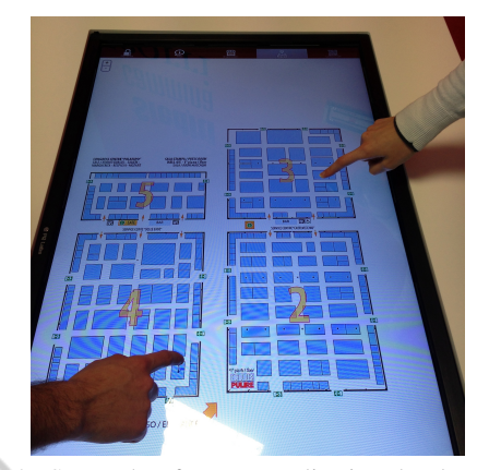
Figure 3: Screenshot from an application developed for a local exhibition.

Let us consider as example, an application with a map, e. g., a map of a city with the list of its museums, or a map of an exhibition with the position of the stands. The map can be rendered with HTML5 on a WebView (see Figure 3). If the user touches a museum or a stand the application opens a new window, with the web site of (or a page dedicated to) the museum/stand, and the user can interact with this window, resize it, or move across the table. If the user touches the "go to the map" button on the new windows, the initial window with the map is moved over the current window of the user. Figure 3 shows a screenshot from an application developed for a local fair.