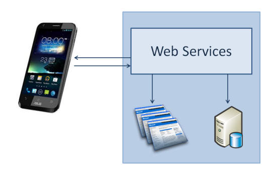
Figure 1: Architecture of an application using the WA.

The Web Approach (WA) allows the programmer to develop a web application using HTML, CSS and Javascript. Given the new emerging features of HTML5 and CSS3, these technologies allow the creation of rich and complex applications, therefore their use cannot be considered a limitation. The applica-