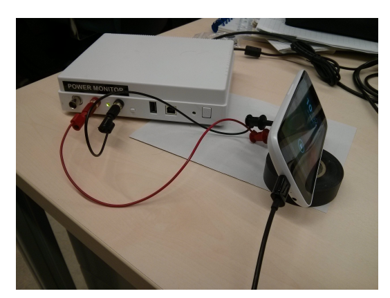
Figure 4: Hardware setup of the system.

Our goal is to compare energy consumption of applications developed in a native way or using a