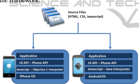
Figure 3: Interpreted Approach architecture.

many and which features depend on the chosen framework) through an abstraction layer. This approach allows the developer to design a final user interface that is identical to the native user interface without any additional line of code. This approach can reach an high level of reusable code, but can reduce a little the performances due to the interpretation step. Titanium (Appcelerator Inc., 2013a) is an example of this kind of framework and Figure 3 shows the architecture of the framework.