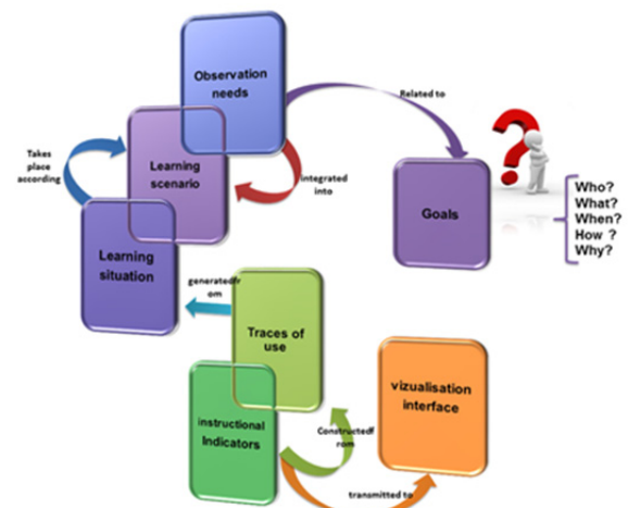
Figure 2: A general idea of our concept of observation strategy.

The concept of observation strategy is related to how the observation is organized. Indeed, this organization is concretely driven by various observation needs for different actors and different objectives. It is also intimately linked to how the learning situation is organized, the learning scenario,