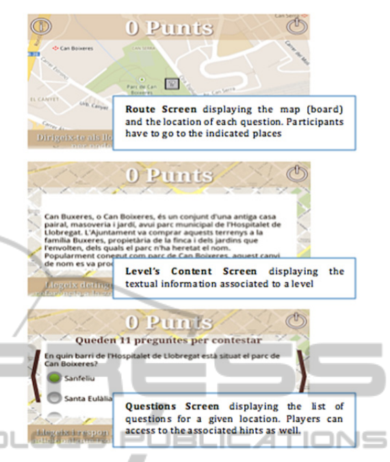
Figure 3: Some screenshots of the mobile application.