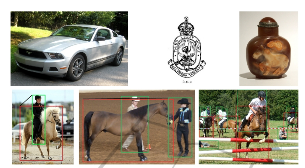
Figure 1: The upper row shows: A Ford Mustang, the 3rd Light Horse Regiment hat badge, and a snuff bottle. The lower row shows: A human riding a horse, one human leading the horse and one bystander, and seven riders and two bystanders. Bounding boxes are displayed.

solver (Stamborg et al., 2012) to parse the Wikipedia articles. For each word, the parser outputs its lemma and part of speech (POS). In addition, the parser produces a dependency graph with labeled edges for each sentence as well as the predicates it contains and their arguments. For each article, we also identify the words or phrases that refer to a same entity i.e. words or phrases that are coreferent.