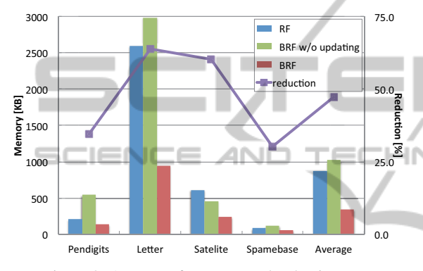
Figure 3: Amount of memory and reduction rate.

Figure 3 shows the amount of memory for each method with minimum error rate and the reduction ratio of the proposed method compared to the random forest. The amount of memory required by the