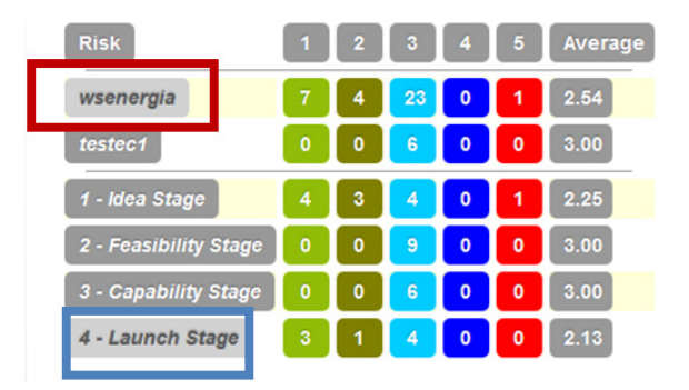
Figure 4: Print screen of the risk profile of each stage and its average.

If it stands between 2 - 3; as " Risky " if it stands between 3 - 4; and in the case it stands above "4" as " Impracticable ".