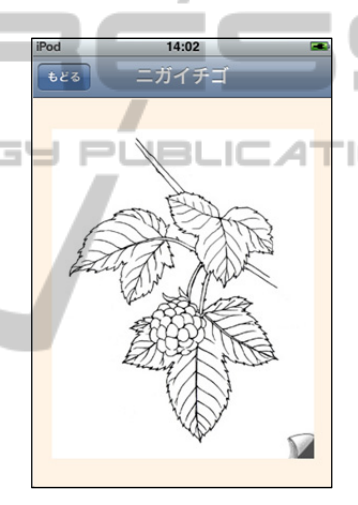
Figure 3: Screenshot of the monochromatic sketch of characteristics of the indicator plant.

in colour, and a comment describing the characteristic is displayed at Figure 4. In this colour sketch, the characteristic red fruit of R. microphyllus is shown.