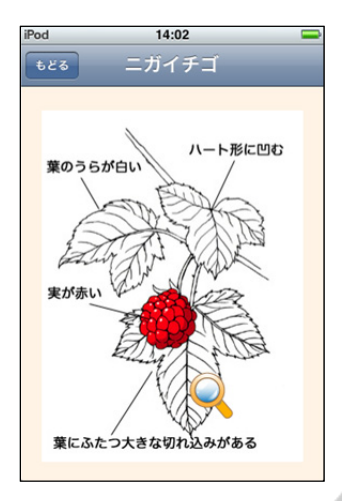
Figure 4: Screenshot of the colour sketch of characteristics of the indicator plant.