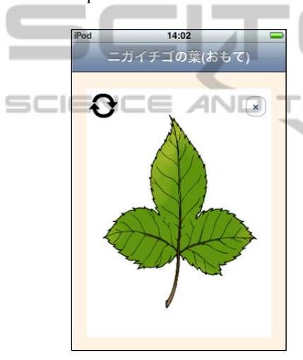
Figure 5: Screenshot showing the upper side of an enlarged leaf.