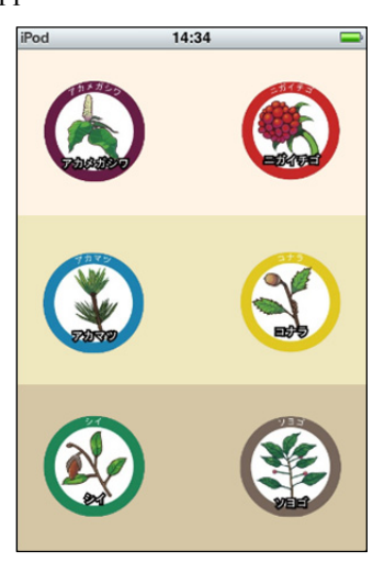
Figure 1: Home screen of the 'Pocket Plant Guide'.

Figure 1 shows the home screen of the 'Pocket Plant Guide'. Six types of indicator plants are shown as icons on this screen. Flicking the screen to the left reveals the remaining 6 types of indicator plants, also shown as icons in Figure 2. The teacher explained to the students that in order to display the remaining 6 types of indicator plants, the screen should be flicked to the left. When one of these icons is tapped, for example, Rubus microphyllus , a monochromatic sketch of the indicator plant in Figure 3 appears.