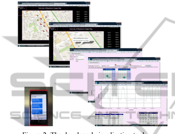
Figure 2: The developed visualisation tool.

system. Moreover, we have added visualisation of the data from the smart meters, deployed in our test bed, to the data collected from the cRIO devices in the substations. The figure below displays data over a period of one week. The x-axis presents the time, here the days of a week, and y-axis represents the power consumed by the selected smart meter. The peak (week days) and off-peak (weekend) are illustrated.