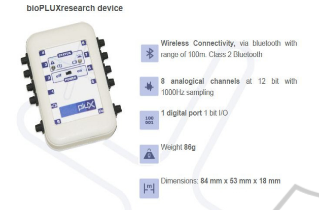
Figure 1: The look and characteristics of the instrument.