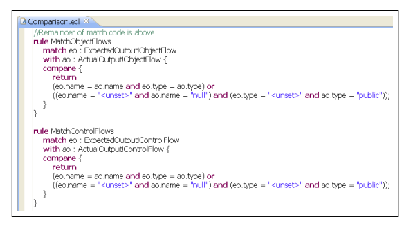
Figure 2: ECL rules to remove false positives.

We find the lower level problem from our example in Figure 1: The elements are not matched because the MOLA transformation sets the name and visibility of these elements to null and public, respectively, rather than to unset, as in our expected output. The issue is not that the MOLA transformation is wrong in doing this, it is that our comparison method should interpret them as equal. We specify this using the ECL as demonstrated in the rule definitions in Figure 2. The top rule block accounts for the Object -Flow false positives while the bottom rule block accounts for ControlFlow false positives. Implementing this rule removes 34 of 95 listed differences outlined in our transformation test. Many remaining false positives can be rectified with analogous rule definitions to those in Figure 2.