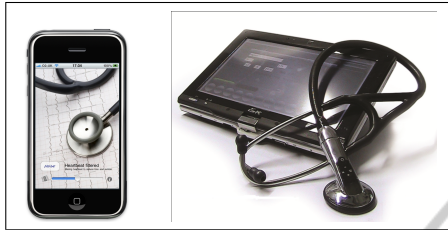
Figure 1: iStethoscope and the DigiScope Collector system.

tal of 656 audio files provided for the challenge. All relevant patient and auscultation information was annotated by clinicians from RHP using the DigiScope Collector system, including the presence of abnormal sounds such as murmurs. Each individual heartbeat was manually segmented.