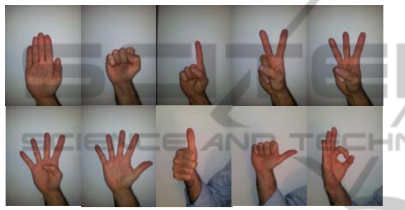
Figure 1: The defined gesture vocabulary.

The rest of the paper is as follows. First we review related work in section 2. Section 3 introduces the actual data pre-processing stage and feature extraction. Machine learning for the purpose of gesture classification is introduced in section 4. Datasets and experimental methodology are explained in section 5. Section 6 presents and discusses the results. Conclusions and future work are drawn in section 7.