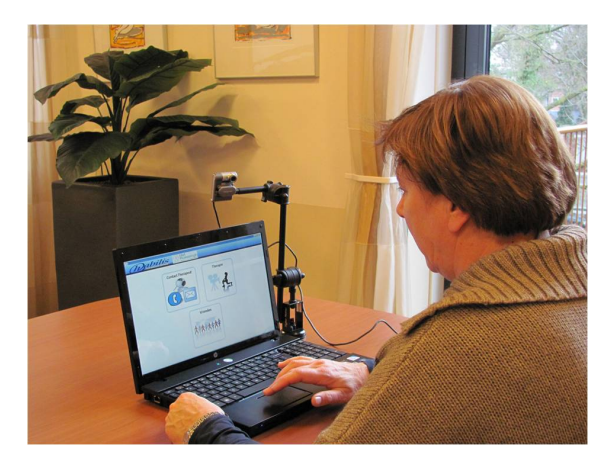
Figure 1: The exercise tele-rehabilitation service (1).