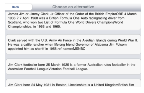
Figure 2: The alternatives to choose from (part).

In this section we briefly introduce the guiding part as it is implemented on the mobile device. Whenever the system finds any possible ambiguities in the search query the user receives a list of cells containing short expressive context information for the search term. In our example (Fig. 2) the search query has been "Jim Clark" and the user gets presented all possible found meanings. After selecting one of the cells by simply tapping on it the list-view flips back and the related topic graph is shown. In our example Fig. 3 shows the associated topics for Jim Clark the racing driver, Fig. 4 shows the results for Jim Clark the Netscape