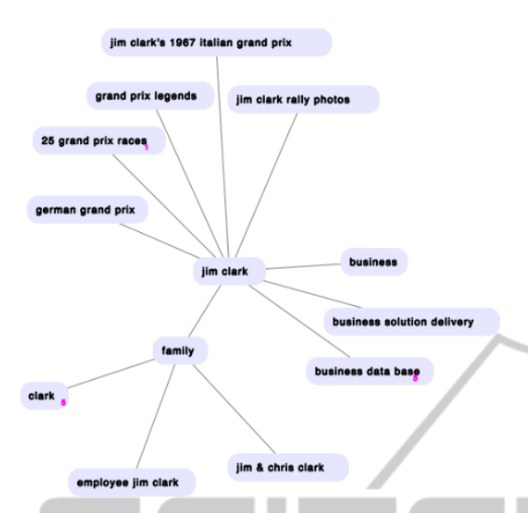
Figure 1: The associated topics refer to three different entities.

a graphical structure of that topic and associated topics that are found.