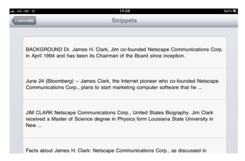
Figure 5: Excerpt of the snippets for the Netscape founder James "Jim" Clark after double tap on the node "netscape communications corp".