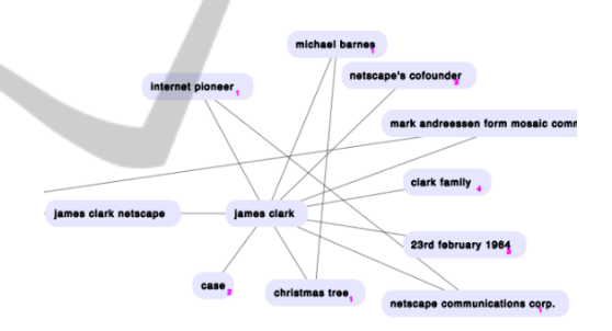
Figure 4: Excerpt of the topics for the Netscape founder James "Jim" Clark.

founder. The user now may interact with the graph by a single tap on a node - shows new associated topics for the node; squeezing with two fingers - zooms the view; sliding around - moves the topic graph; double tap - brings in a new view showing the snippets containing the topic of the node (Fig. 5). The cells are interactive and by tapping on a cell the corresponding Web page will be shown (Fig. 6).