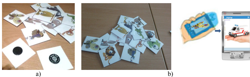
Fig. 2. (a) Cards with RFID tags attached are used as interaction resources. Through them, the user can play. Every card has an image representing something in the game. (b) New style interaction, to interact with the system the user must bring closer the cards to mobile devices.