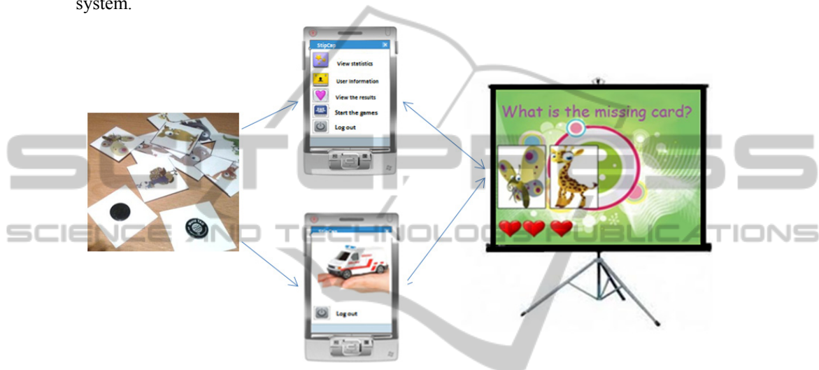
Fig. 1. Multi-Device Environment that support Distributed User Interfaces.

An amount of devices are used altogether on the environment where the games run: digitalized objects, mobiles devices, laptop, projector, and so on. These devices communicate each other through identification (RFID) and wireless (WiFi) technologies. The application user interface is distributed in such a way that interaction becomes more natural. The user do not need to know anything about computers or any kind of devices, but using the system naturally moving cards, approaching them to other places and so forth. These movements lead to the performance of task in the system.