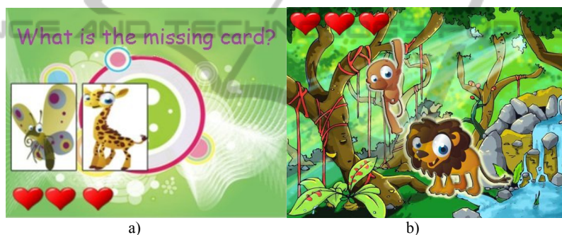
Fig. 5. (a) Main User Interface corresponding to the first game. (b) Main User Interface of the second game.