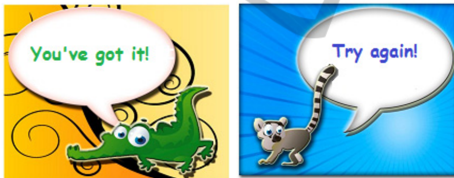
Fig. 4. Messages when winning or losing the game to encourage and motivate users.

Children with ADHD have low self-esteem and may be easily frustrated; therefore, when the children lose the game, the displayed messages have to be motivating for the children to try again. The idea is not to give importance to the fact of having lost. Hence, the messages designed are as follows. When children win the game, the message displayed is “You’ve got it!” and when children fail then the message displayed is "Try again", as depicted in figure 4. The features of three games composing the system are detailed hereafter.