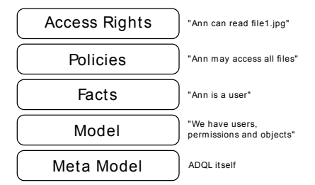
Figure 1: Structure of the Access Definition Query Language.

The design of ADQL is structured in five layers depicted in figure 1.