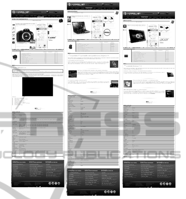
Figure 2: First step - specification block identification.

The final result of the product specification block detection is illustrated in figure 2. The specification block is colored in light grey.