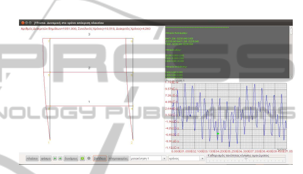
Figure 5: Module "jTframe" screen depicting a time history animation of the three-story frame motion plus its displacement response as defined by the user; the green box marks current state information.

pec", "jframe") were taught to 4th year undergraduates after the first five weeks of instruction, in groups of 35 students, for a two hour period in a computer laboratory. These sessions were preceded by lectures summarizing basic structural dynamics concepts and the relevant material was accessible through the electronic address http//:blackboard.lib.auth.gr. They were then followed up by two more lectures on the semester project, for which the students could utilize the tools available to help complete it. Course evaluation results indicated a favourable reception of this type of classroom activity by the students involved.