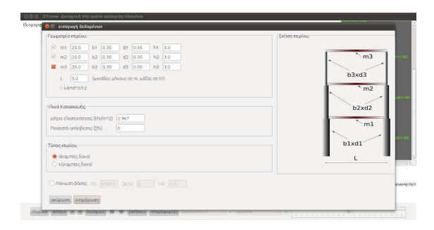
Figure 3: Module "jTframe" input dialog box defining the geometrical and material properties of the three-story frame.

as input is (i) lateral dimension and story heights (in m), (ii) story masses (in tons), (iii) cross-section lateral stiffness of the columns (in kN/m) and their modulus of elasticity (in kN/m<sup>2</sup>) (beams are assumed rigid), and (iv) the input response spectrum (either from use of "espec" or from an external ASCII file). Output comprises (i) graphical representation of the frame's modal shapes and associated natural frequencies, (ii) generalized mass values and participation factors, and (iii) the resulting spectral displacements, velocities and accelerations for each mode of the structure. Figure 3 depicts the input dialog for a threestory frame and in Figure 4 we present the respective input dialog for the forces. Finally, output regarding this example is given in reference to module "jTframe" in Figure 5.