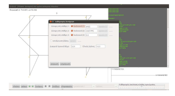
Figure 4: Module "jTframe" input dialog box defining the external time-dependent loads, the total time interval of interest plus the time step, followed by output of modal information.

Regarding actual use of the present educational package for structural dynamics analysis, we conclude that the teaching experience accumulated during the first two years of use in actual classroom environment has been most positive. Three modulus ("jesdof", "es-