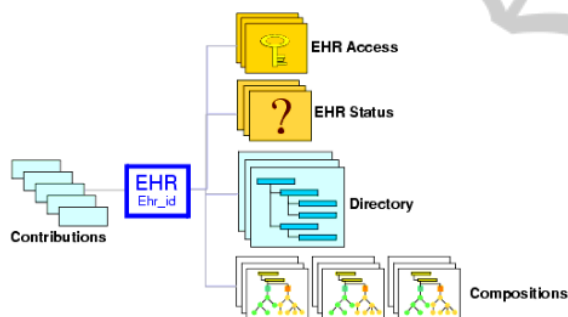
Figure 2: High Level Structure of the openEHR (openEHR 2011).

The patient repository consists in one unique XML node that contains the EHR records, following the openEHR structure (Figure 2).