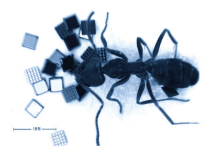
Figure 1: An Ant Playing with RFID Chips.

With the official release of the Electronic Product Code Network, we are about to see the "Internet of things" paradigm enter the big time -the world of mainstream commerce.the term Auto-ID refers to any broad class of identification technologies used in the world of commerce to automate, reduce errors, and increase efficiency. These technologies include bar codes, smart cards, sensors, voice recognition, and biometrics. But the Auto-ID technology currently on center stage is Radio Frequency Identification (RFID). RFID is a generic technology that entails using tiny wireless transmitters to tag individual objects, uniquely identifying them. Such RFID tags allow companies to automatically track objects, trigger events, and perform actions upon the objects. RFID chips have now been made as small as 0.3 millimeters (about the size of a pencil tip). There are a variety of types different -- active (battery-driven), semi-passive (also battery-driven), and passive (driven by the inductive energy of a tag reader).