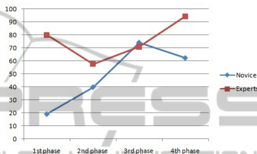
Figure 3: Percentage of novices and experts business browsing in the four phases identified in (Fronza et al., 2009).

Figure 3 indicates that both experts and novices when they browse devote most of their time browsing for business purposes. Though, it can be noticed that in the 1 st and 2 nd phases experts devote significantly more time to Business Browsing than novices. The results may indicate that when developers go to Internet during their working time the reason in most of the cases is a lack of necessary knowledge.