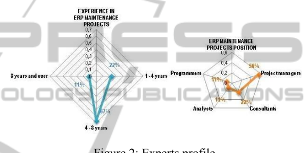
Figure 2: Experts profile.

Given the absence of studies on ERP maintenance risks, it was possible that the preliminary list of risks did not bring together all ERP maintenance risks. Moreover, the list had not been validated. So, we consulted 9 ERP maintenance experts. The optimal number of experts depends on the characteristics of the study itself. We can, however, say that the greater the heterogeneity of the group, the fewer is the number of experts recommended, 9 being a good size (Okoli and Pawlowski, 2004). The main selection criterion considered was recognized knowledge in the research topic and an absence of conflicts of interest. Figure 2 shows the profile of consulted experts.