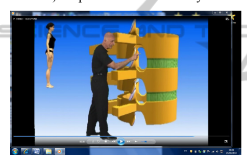
Figure 2: Screen of a podcast.

Free online access to our podcasts (two last lines in the bottom): http://anatomie3d.univ-lyon1.fr/