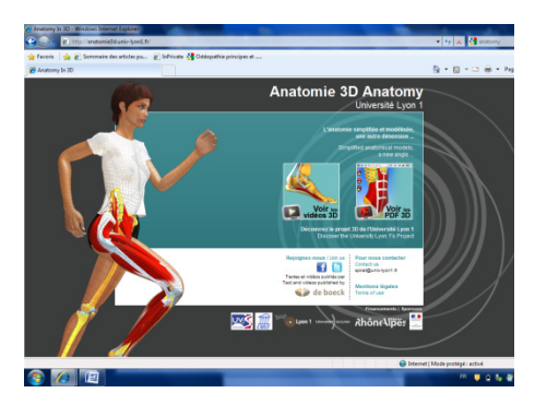
Figure 1: Screen of the online access.