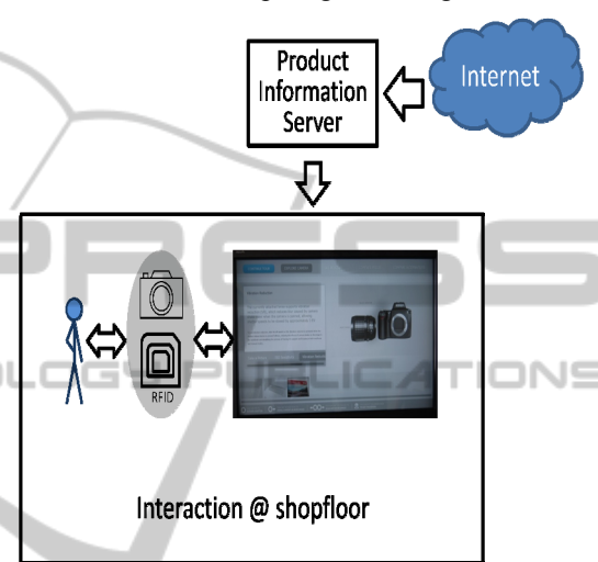
Figure 1: Interaction sensor-based sales Terminal.

RFID-technology with a terminal located at the retailer. When a consumer picks up a product, the system starts to interact. It identifies the product and gives advice what should be tested (e.g. "try the sports modus of this camera by focussing a moving person. Check the result on the screen."). Additionally information like testimonials from social networks is embedded. The concept aims to generate shopping experience in order to establish an emotional commitment of the consumer. An illustration of the concept is given in figure 1.