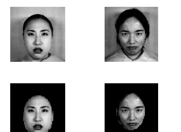
Figure 2: Up: original faces from JAFFE database. Down: Correct face detection obtained using the proposed method.

As our method is not based on any learning paradigm, we just take (randomly) 5 images for adjusting some few parameters of the method (number of considered modes and threshold for binarization process), keeping the rest of the images (208) for testing it.