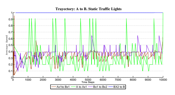
Figure 2: A plot of the average speeds attained by vehicles traversing four roads in the trajectory \{a_{start} \rightarrow b_{finish}\} .

In these experiments (Figure 1), two separate simulation batteries where defined: one set for static and one for adaptive lights. Three different situations were used to simulate the road had a low traffic flow