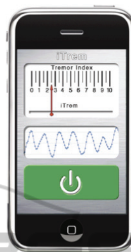
Figure 1: Actual tremor index meter.

tremor data, including amplitude and frequency, using the iPhone's accelerometers.