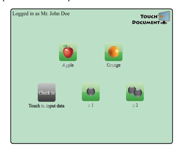
Figure 3: Main Menu of TnD.

• The utilization of mobile devices, in particular of mobile phones, guarantees an absolute mobile and ubiquitous data transmission but and additionally enables a voice channel for real time support for patients or medical personnel.