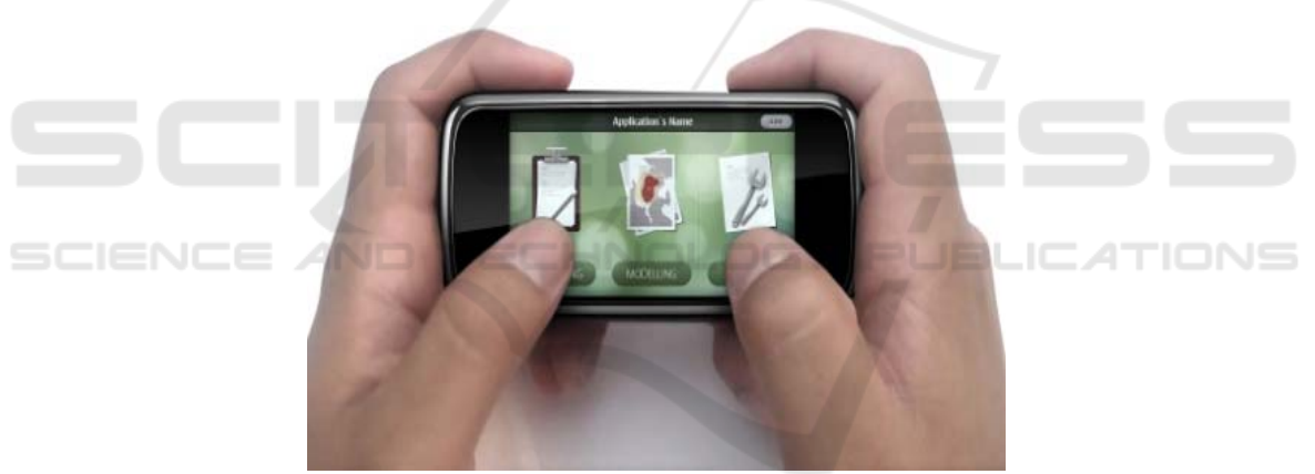
Fig. 1. Main Menu in a mobile device demonstrating the usability with the thumbs.

The system needs to have easy browsing, be intuitive and have few steps necessary for performing tasks. The kind of device that is being proposed for use is a Smart phone , which has a limited screen size. That means that the icons need to be arranged in such to be very easy to use. Fig. 1 shows the screen of the main menu of this tool in a mobile device.