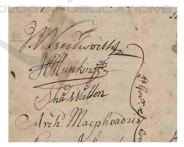
Figure 2: Detail of the Oath to King George II (1727).

Third, researchers need not only to be able to read the manuscript but also have a means to closely examine the handwriting, notations, and other aesthetic and tactile features of the manuscript. In effect, the manuscript is not merely viewed as text but also artifact. It is not sufficient to solely provide