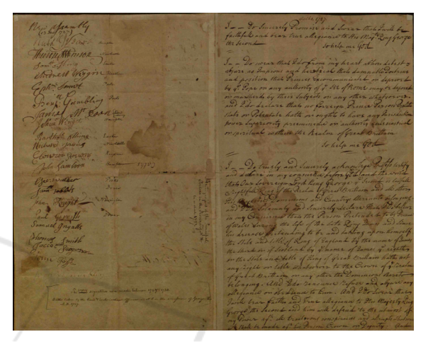
Figure 1: Handwritten Oath to King George II of England (1727) with multiple signatures. The figure represents a four-page document. It is simultaneously textual and visual.

Second, manuscripts require a means to preserve the context and meaning of a document. This requires a means of maintaining a visual relationship between pages. This is no different than a book or a newspaper. Context and meaning is lost if the sequential continuity is not maintained between the pages. An orchestra, for example, will be lost if a page in a musical score is misplaced or missing.