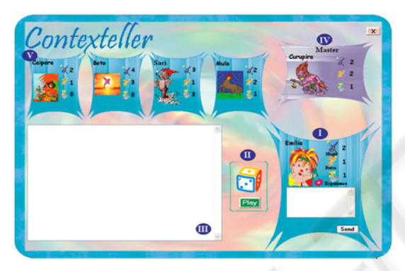
Figure 1: Contexteller interface.

Figure 1 shows the interface available for players. This interface allows the players to see their card (I), their dice (II), and the text area (III), which allows the master to read all the messages sent to students and master during the composition of the collaborative story. In area (IV), the card, with another color and size, represents the master of the game, and area (V) shows to other characters' card (Silva et al. , 2009).