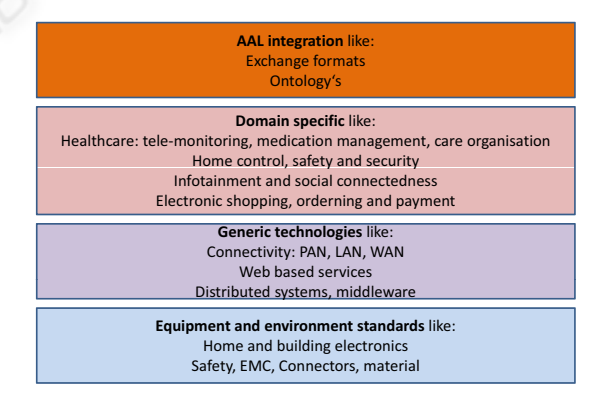
Figure 2: Standards relevant for AAL (AALIANCE, 2009).

Although the "Integrating the Health Care Enterprise" (IHE) (IHE - Integrating the Health Care Enterprise, 2008) started to implement the framework for health applications, the communication structure could be used as well for homecare applications for elderly and persons with dementia. This could be easily done because there are already structures for