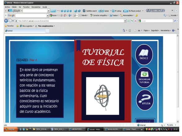
Figure 1: Tutorial.

knowledge to begin the academic year, and that this should be interactive, amusing, concise and with animations (Figure 1). This tutorial can be supplied in a pdf format and downloaded for its subsequent printing out and study.