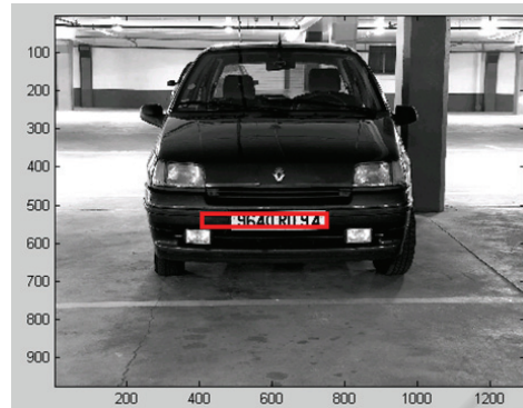
Figure 2: Selecting of license plate.

Our algorithm is based on the fact where an area of text is characterized by its strong variation between the levels of gray and this is due to the passage from the text to the background and vice versa (see fig. 1.). Thus by locating all the segments marked by this strong variation and while keeping those that are cut by the axis of symmetry of the vehicle found in the preceding stage, and by gathering them, one obtains blocks to which we consider certain constraints (surface, width, height, the width ratio/height,...) in order to recover the areas of text candidates i.e. the areas which can be the number plate of the vehicle in the image.