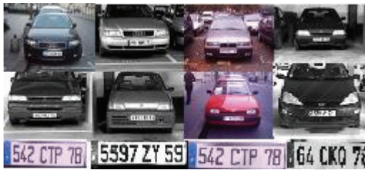
Figure 1 : Some examples from the database training.

The images employed have characteristics which limit the use of certain methods. In addition, the images are in level of gray, which eliminates the methods using color spaces.