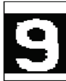
Figure 5: Extraction of one character.

The Headers of the detected characters are considered as noise and must be cut. Thus, we make a 90 degree rotation for each character and then perform the same work as before to remove these white areas.