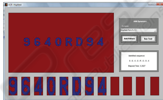
Figure 6: The graphic interface which recognizes the plate number and posts the result in text form.

For our study, we used 3 kinds of Hopfield Networks and 3 kinds of MLP Networks, always with one hidden layer. In the case of MLPs, we train one MLP per character; it means that there are 36 MLPs for doing the recognition. In the case of Hopfield there is only one network that memorizes all the characters.