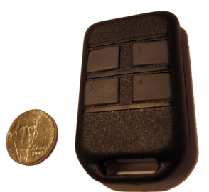
Fig. 2. Wearable sensor for wireless remote identification system.

Remote Identification System. Mobile objects wireless identification.