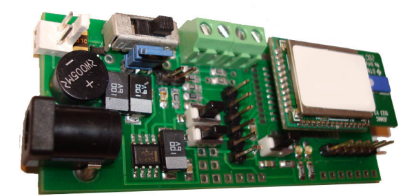
Fig. 1. Universal platform for WSN.

similar devices in different application areas. We also can save resources by using our platform because of the universality. It also allows us quickly change priorities of the system, which makes possible using our platform to achieve different goals by working with all popular COTS sensors.