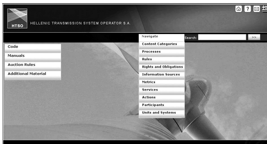
Figure 3: HTSO Electronic Library.

The system was deployed and made available to the public in October 15th 2008 through the URL http://emarketinfo.desmie.gr/htso/user (figure 3). From there one can examine a representative part of the ELMO ontology by using the available taxonomies for content navigation.