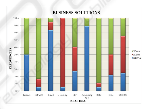
Figure 2: e - Business Solutions.

Even though some firms do have the Intranet as a mean of intra organizational communication, its level of use remains relatively low and its functionalities under used. Although, Intranet exist yet the purpose of use and its outcome is relatively low.