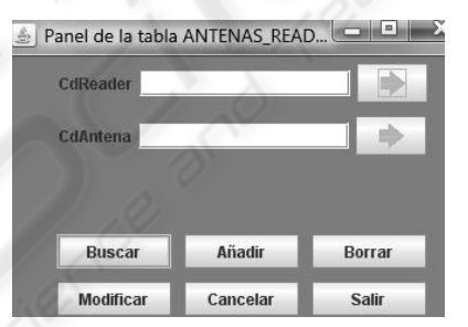
Fig 3. Database panel example from DEPCAS GUV.

Based on the concepts of high-level design have been shown we have developed a GUV prototype environment that allows building graphical environment from specific domain. The prototype has a graphic editing system that allows creation, modification and deletion of graphical elements. This environment ediGUV define a core container referred as DEPCASGUV in which may include other edited elements. The prototype operates two types of graphic elements: the basic elements that are provided directly by the window SDKs that is in use. And the compound elements of DEPCAS that are the result of basic elements compositions for a specific function in the DEPCAS. The basic graphic elements in the original DEPCAS are: windows, buttons edit fields , text fields, check boxes, combo boxes. DEPCAS graphic elements are: panel database (Add-Delete-Modify Data), list of dynamic database, list of static database, RFID / EPC Label, RFID Reader Point, Dynamic graph (Route / Forecast)