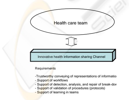
Figure 1: Challenges and requirements of Innovative Health sharing channels.

The following Figure 1 captures some main challenges to be addressed in order to ensure patient security in future distributed health care.