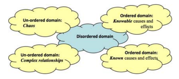
Figure 3: Cynefin "domains".

We have taken the feedback/forward aspect of agile development comfortably into grounded theory, devising and beneficially using a variant that included the released software as part of the emergent theories. This supports our view that grounded theory underpins agile development.