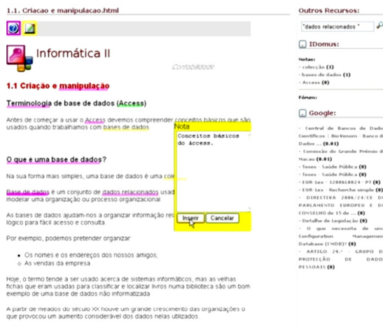
Figure 2: GITS interface to add notes to contents.

Only for students with a very high preference for the active style the GITS made an adaptation of the learning activities to explore the potential and students creativity. For students with a very high preference for the reflexive and theorist styles, the system did an adaptation on forums, to improve reflection, and on the Chat for the Active style to promote a direct discussion.