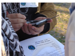
Figure 5: ArcPAD® and question sheet for the GIS Day2008 Geopaper.

Then, each team had to search for places and answer a geographical question in each place (Figure 5 and Figure 6).