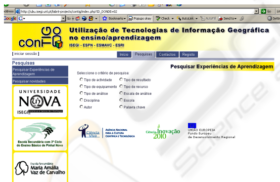
Figure 1: The ConTIG web page.

The ConTIG project also created a web page ( http://ubu.isegi.unl.pt/labnt-projects/contig ) that provides free access to all the materials produced, such as the learning experiences with the geographical data, teacher and student's guidelines and also the results (such as maps and reports) produced by the students (Figure 1).