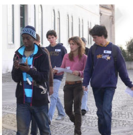
Figure 2: Geopaper activity during GIS Day2007.

One of the first activities of the ConTIG project was the celebration of GIS Day in the ISEGI-UNL campus in November 14 th 2007, showing how GIT works and some of its possibilities. Students and teachers from both partner schools were present to meet each other and got to do a hands-on activity with GPS and GIS technologies. The activity consisted on a Geopaper on the ISEGI-UNL campus. The students had to find clues with the help of a GPS receiver and ESRI's ArcPad ® technology (Figure 2 and Figure 3).