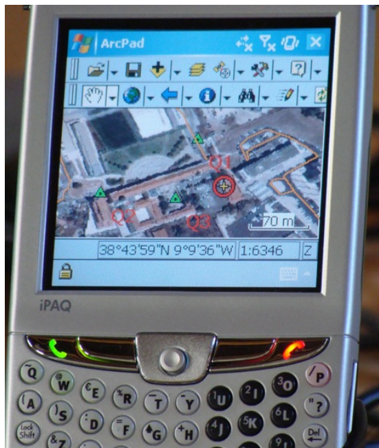
Figure 4: ArcPAD® with the information for the GIS Day2008 Geopaper.

and 16H. In each shift, there were seven teams of four or five students that received some information about GIS, GPS and how to use the ArcPad® (Figure 4).