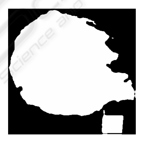
Fig. 2. Isoclust classified image after convolution with 9x9 mean mask.