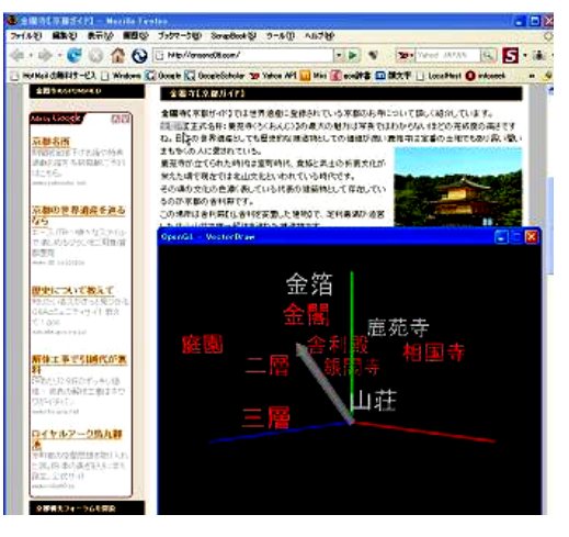
Figure 2: Vector manipulation.

This work was partially supported by the JSPS Grant-In-Aid no.18300027.