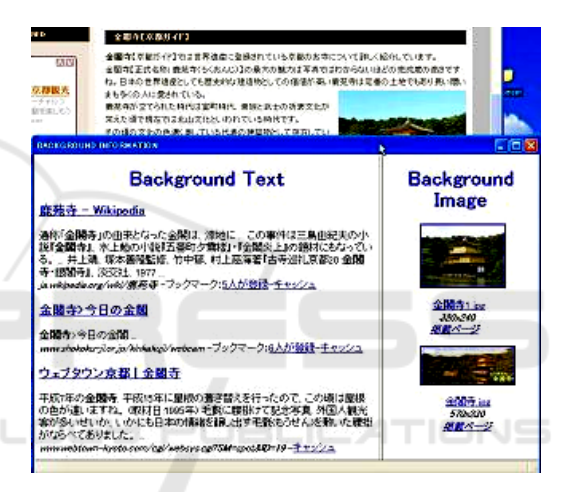
Figure 3: Acquisition of search results.