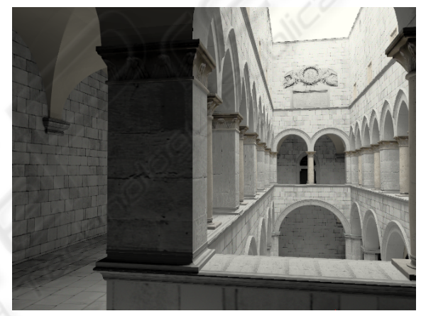
(b) Scene 2: Sponza atrium. Highly textured scene with 67,462 triangles. We used huge area light to simulate day light. Shooting and multicache methods combined lasted 4.15 sec. We used 22,615 voxels and 256 directions.