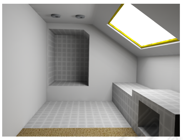
(a) Scene 1: Polygonal scene with 1.176 triangles. Shooting and multicache methods combined are 6.1 sec. The reconstructions phase lasted 630 sec. We used 108,455 voxels and 146 directions.

Our results show that our voxel based method can be competitive and accurate for precise multi-bounce global illumination. It provides very large numbers of rays per seconds for discrete rays, which make the technique promising. To improve the method, we could possibly find a method with linear complexity with respect to the number of rays for the reconstruction process also, which could result in dramatic reduction of the reconstruction time, which is the dominant term. Then, a GPGPU acceleration for the discrete linear method could result in a very low-time propagation phase, and should be considered. The current version of the method works only for Lam-