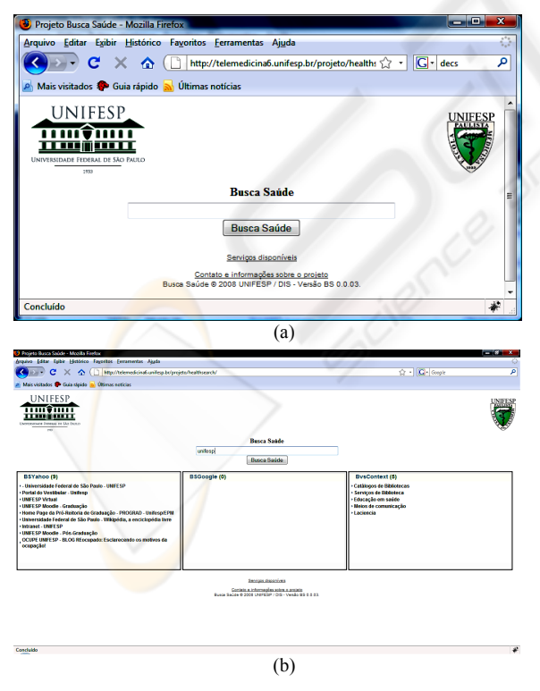
Figure 2: GUI proposed for InHealth portal for healthrelated content web search.

IntHealth, the GUI module of the portal system, has been developed using Ajax (Ajax, 2008) and PHP languages, and the Mini Ajax framework (Mini Ajax, 2008). Its GUI should follow the heuristics concepts of Nielsen (2005).