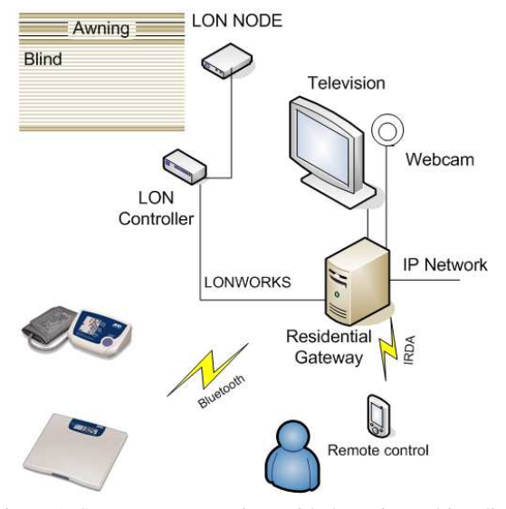
Figure 1: Smart Home overview, with domotic, multimedia and medical devices.

because provides a reliable and open protocol accepted as a standard for control networking in many countries. A typical Lonworks network includes sensors and actuators, for example light sensors or blind motor. As we'll see in Data Model section, RGW monitorizes environment variables from automation home network so when an important event occurs in the home and sensors detect it, an alert or alarm rises in the RGW. This event can be sent to relatives or medical people. The multimedia network typically includes a television, an IP camera or a webcam with microphone, necessary for the dependent person to communicate with relatives and carers. The RGW is able to physically interconnect all networks and devices, and to host the different services which can be managed remotely by the e-health or access provider. Multimedia services, like SIP audio/videoconference is provided to communicate dependent person with doctor/assistant during the medical televisit besides his relatives and friends.