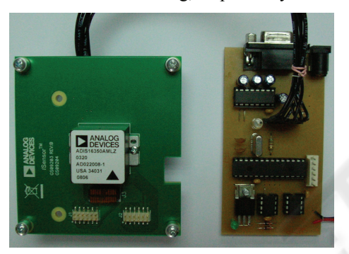
Figure 1: A photograph of the data logger system (right) and a miniature gyroscopes and accelerometers (left).

A Windows based application software on a personal site was specially developed to control the operations of the data logger; i.e. time stamp setting, sample time setting and data capturing for analysis. Figure 2 shows the screenshot of the results from the data logger during the period of 12:43:30 -12:49:00. The first three columns are the time stamp of the recorded data which are arranged in the following format: the angular accelerations in the x, y and z axes and the linear accelerations in the x, y, and z axes. It is noted that the data logger was programmed to sample data every 1 second period but it is capable of immediate recording the new incoming data if and only if all parameters change more than the predefined acceptable delta which are 6 units in this case. Also, it is noted that in order to get the true value of both angular and linear accelerations the recorded values must be multiplied by 0.07326°/s<sup>2</sup> and 2.522 mg, respectively.