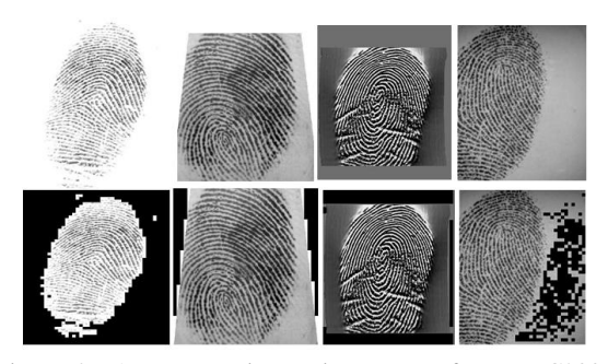
Figure 3: 1st Row: Fingerprint Images from FVC2004 database, 2nd Row: Mean and Variance Based Segmented Images.

4. Select a threshold value. If the std(I) is greater than threshold value, the block is considered as foreground otherwise it belongs to background. Figure 3 shows the segmented images based on mean and variance method. Images in 2nd row show that this method is good only for light backgrounds.