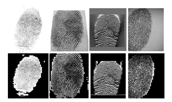
Figure 6: 1st Row: Fingerprint Images from FVC2004 database, 2nd Row: Enhanced Method Based Segmented Images.