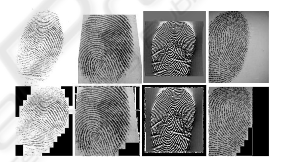
Figure 5: 1st Row: Fingerprint Images from FVC2004 database, 2nd Row: Direction Based Segmented Images.

Figure 5 shows the segmented images based on direction based method. Images in 2nd row show that this method is good for light background and it gives almost same results as mean and variance based technique.